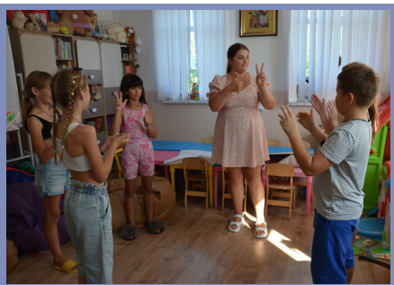
Caritas Radekhiv, Sept. 3, 2024

Each of these encounters has provided us with a more profound understanding of the significance of supporting such genuine grassroots local initiatives.