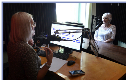
"Radekhiv, interview on the local radio station, Sept. 3, 2024.

The final stop was in Obroshyno, to the Resilience Center. This institution offers support to individuals facing challenging life circumstances, particularly veterans undergoing rehabilitation. During the visit, meetings were held with specialists at the center who provide psychological support and guidance to those in need.