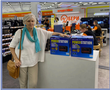
UCP purchased power stations and power banks for the Ukrainians Educational Platform, Sept. 5, 2024

After the visits, UCP purchased power stations and power banks for the Ukrainian Educational Platform in anticipation of a difficult winter ahead due to the destruction of energy infrastructure by Russia.