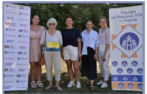
Radekhiv visit to the local Caritas, Sept. 5, 2024