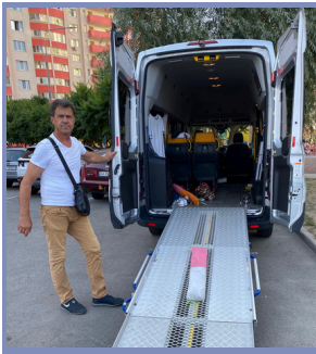
Social Taxi Program, Brovary, Aug.21.24

Ukrainian Charitable Platform (UCP) working through UCP's partner, Ukrainian Educational Platform (UEP), works closely with frontline Ukrainian organizations on a range of projects and initiatives, including providing emergency assistance and support services for children and families affected by Russia's war on Ukraine.